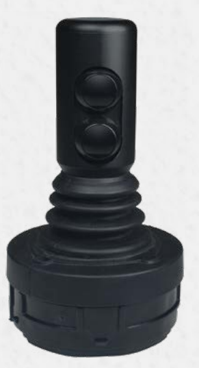
Handle Style 32 with 2 Pushbuttons