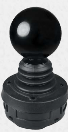
Handle Style 71 with Ball Handle