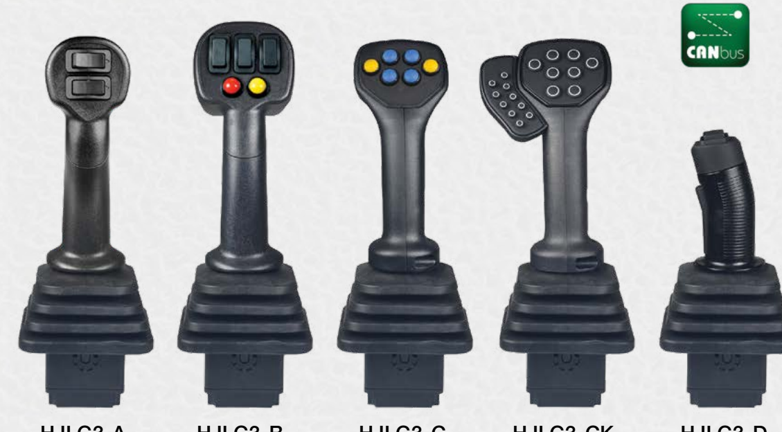
HJLG3-A JHL with G3-A Grip