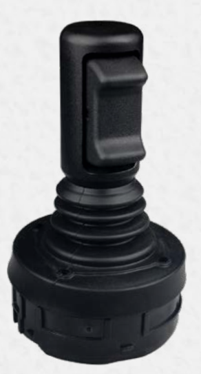
Handle Style 21 with Hall Effect Rocker