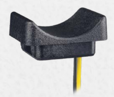
Capacitive Switch Concave Button CS-1