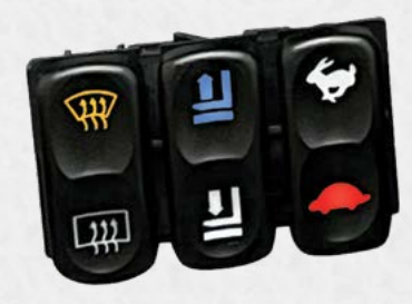
CAN Rocker with Legends