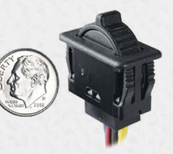
HTWS Paddle Wheel