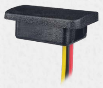
Capacitive Switch Raised Button CS-2