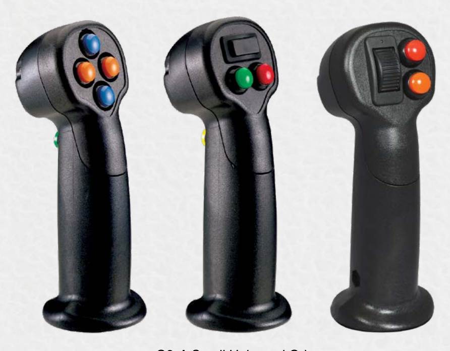
G3-A Small Universal Grips

Either install a G3 on a panel as a fixed control grip or combine with an OTTO Hall effect joystick (JH, JHL, JHM) for a complete operator control solution. The grips are compatible with OTTO's standard pushbuttons, rockers, toggles and Hall effect switches.