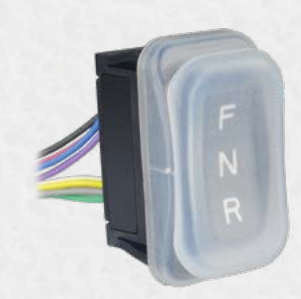
K1S FNR Rocker with Clear Boot