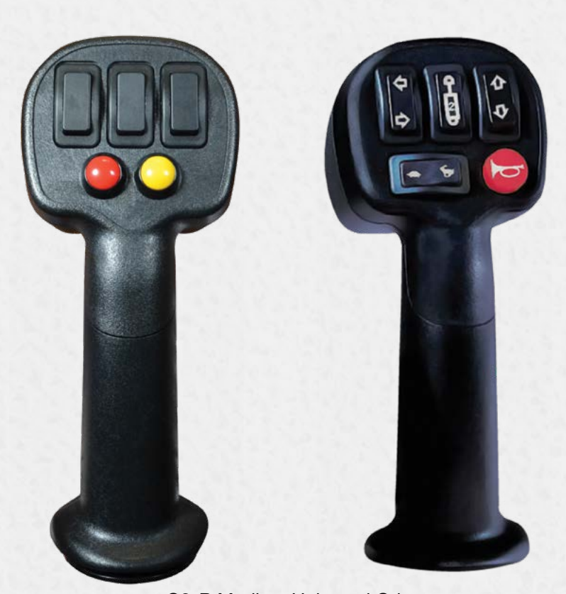
G3-B Medium Universal Grips