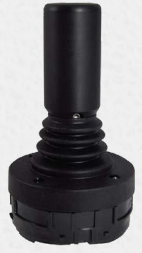
Handle Style 12 Standard Blank