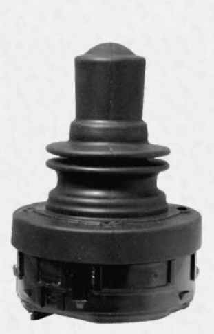
Handle Style 31 with Pushbutton, Half Boot