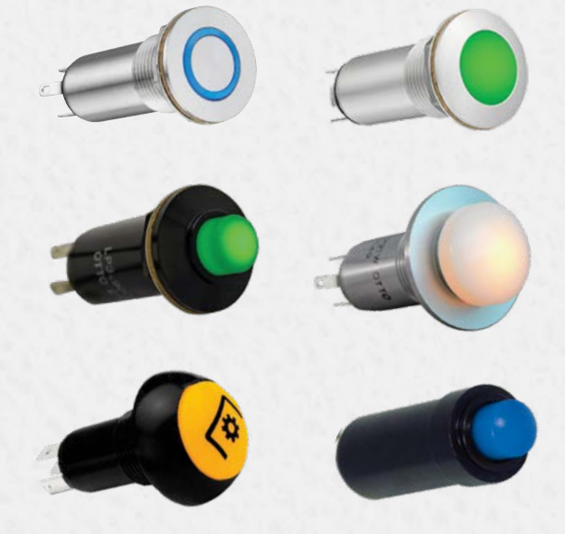
LP3 Illuminated Momentary Action Pushbuttons