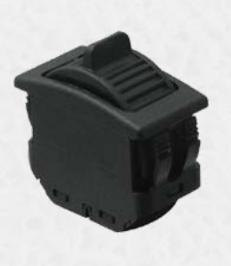
HTWM Paddle Wheel