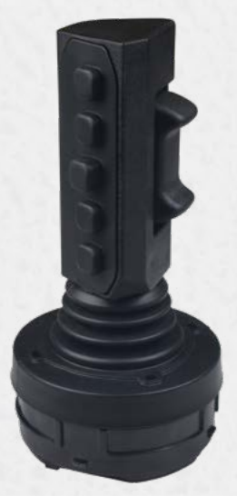
Handle Style 61 with Rocker and 5 Switches