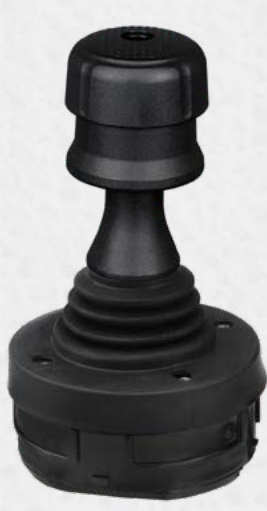
Handle Style 41 with Lockout Handle