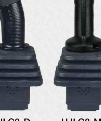
HJLG3-M JHL with G3-M Grip